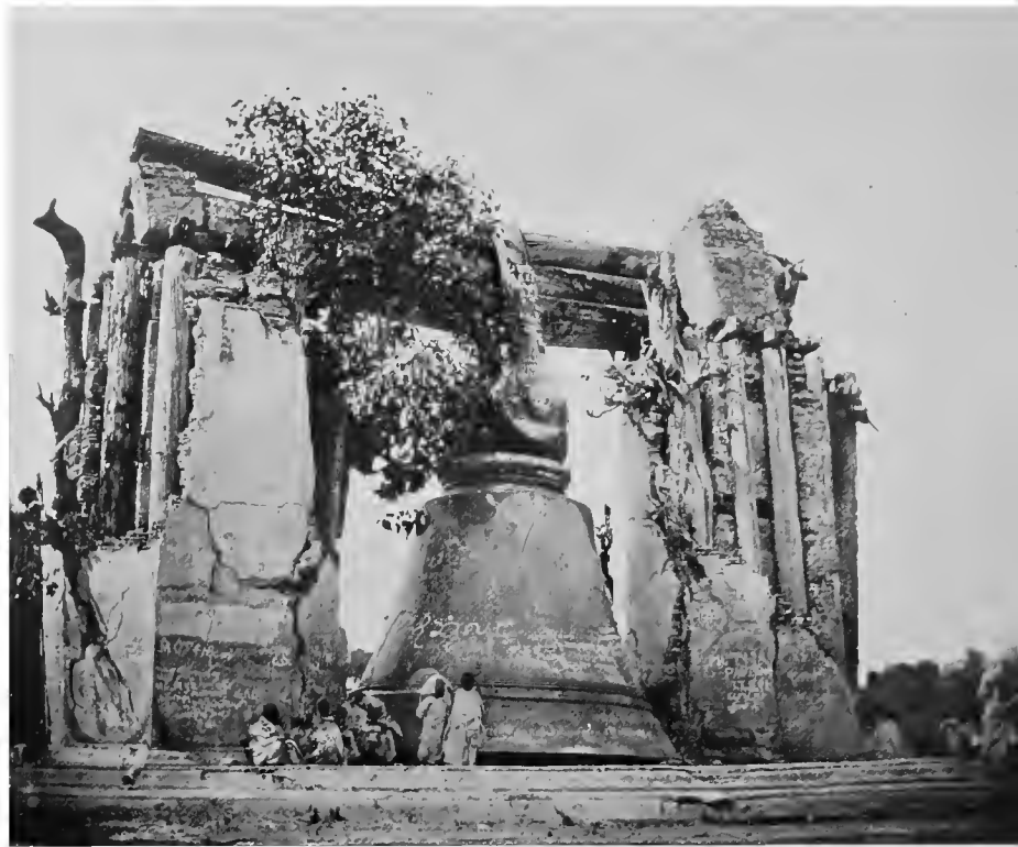
The Mongoon Bell (Largest Intact Bell in the World)